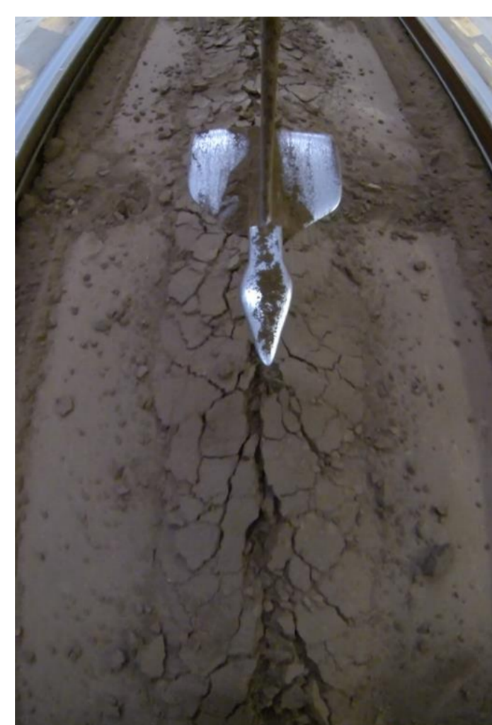
Figure 2: High disturbance subsoiler following an experimental run in Cranfield's Soil Bin