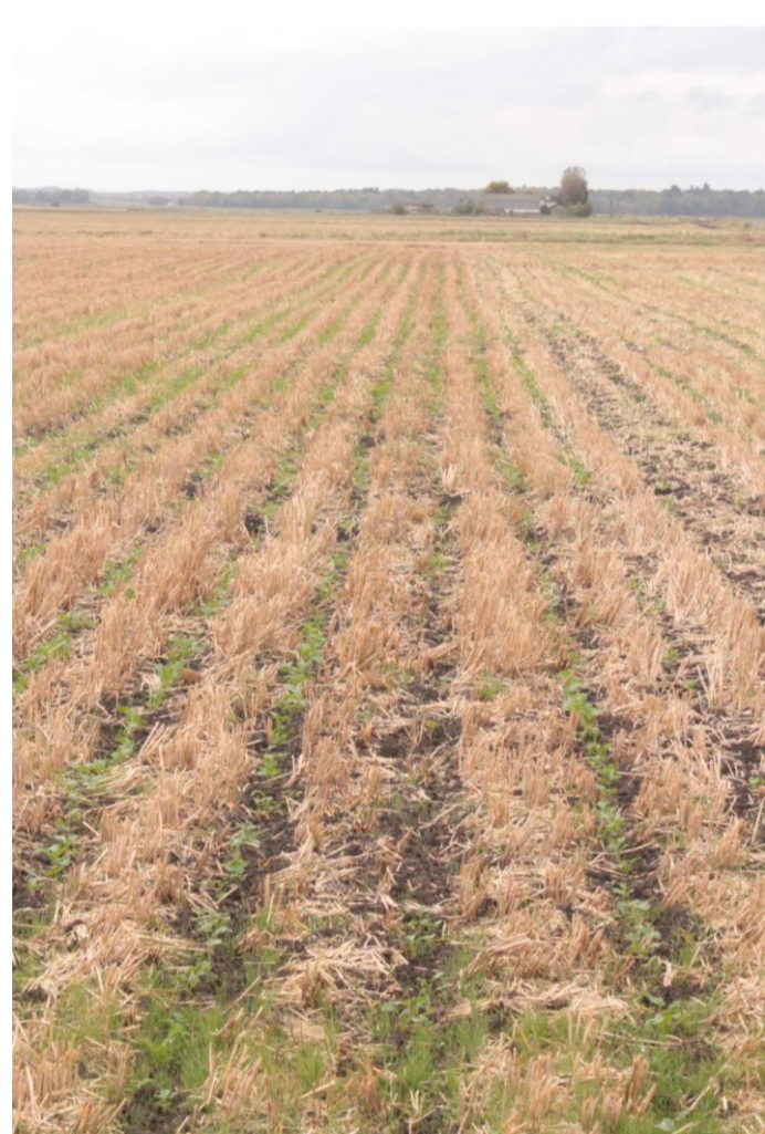
Figure 1: A field which has been subject to strip tillage by a specialist implement