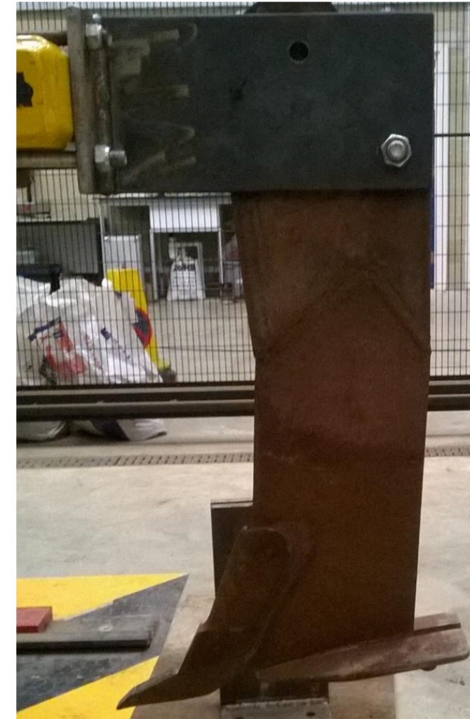
Figure 3: Low disturbance subsoiler mounted in preparation for testing in Soil Bin